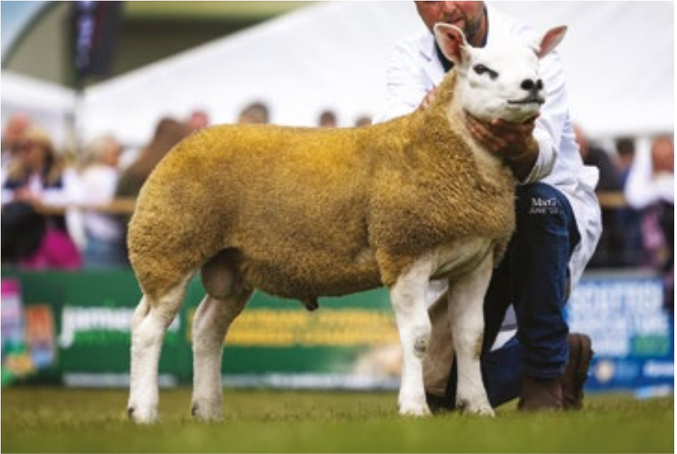
James Innes & Sons, Strathbogie, Reserve Male Texel Champion, RHS 2023