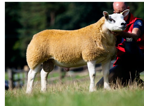
Milnbank