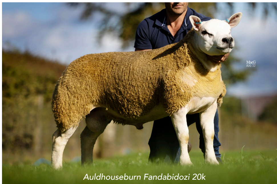
Auldhouseburn Fandabidozi 20k

Last year's Ballymena Babes we had another great sale topping at £2300 for Drumadowney Essence and a full clearance!