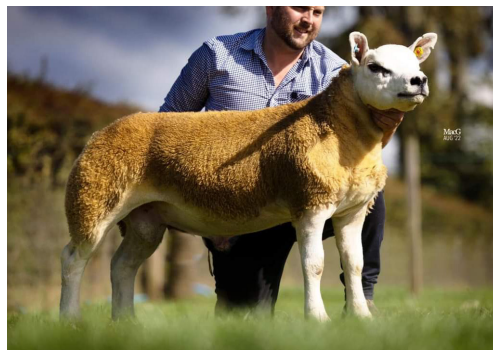
Rhaeadr Flashy Boy