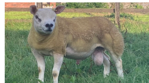
Templepark Eye Candy