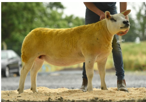
ET Sister Forkins Email, female champion Ballymena Premier 2022 Sold 4000gns