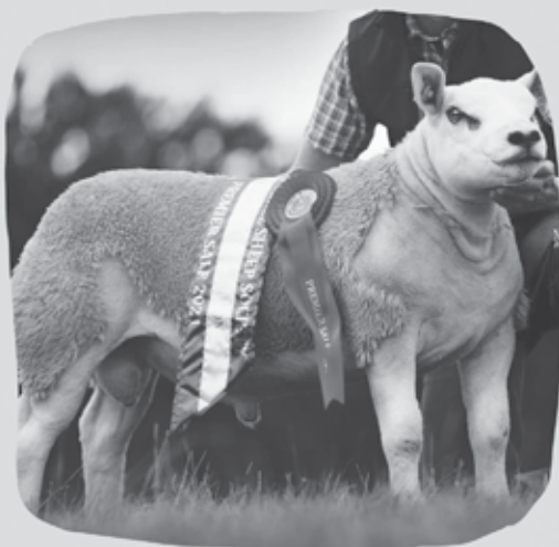
Annagahdown Edoardo Main sire for 2022 Texel lambs

"With the rising cost of inputs like feed and fertiliser you must ensure your animals are thriving by using good quality minerals like Natural Stockcare products to ensure maximum efficiency for your money on your farm".