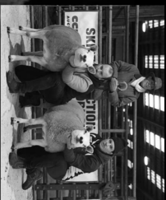
Champion & Reserve 2022

Hosted by Northern Area Texel Breeders Club