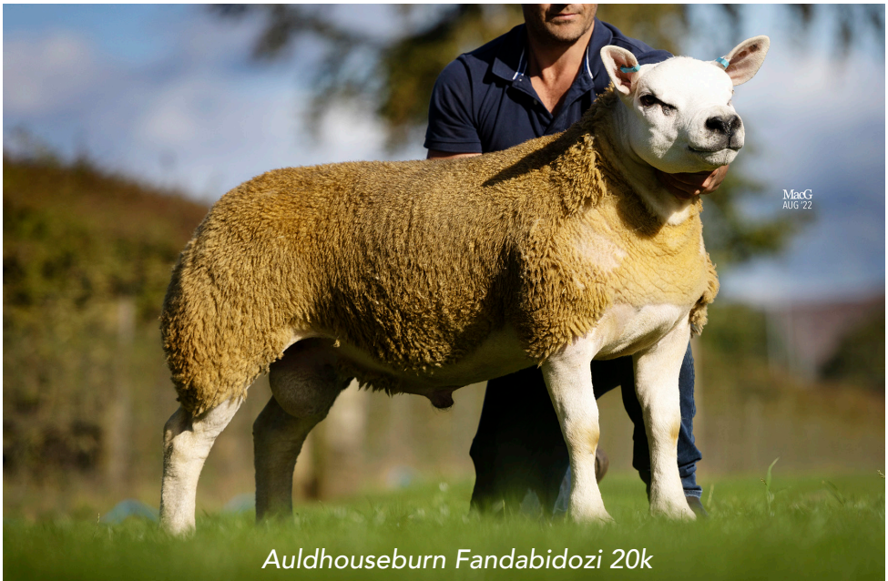
Auldhouseburn Fandabidozi 20k