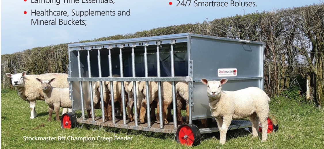
Stockmaster 8ft Champion Creep Feeder

Global Building, 8 Steeple Industrial Estate, Antrim, Co. Antrim, BT41 1AB Telephone: 028 9083 1647 Email: info@stockmasteragri.com