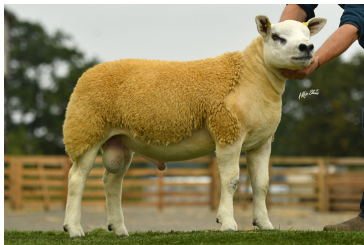
Lakeview Eye Catcher