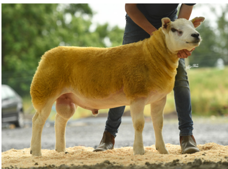
Forkins Finn McCool