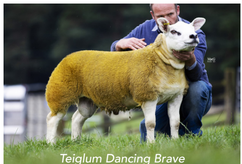
Teiglum Dancing Brave