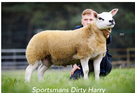
Sportsmans Dirty Harry