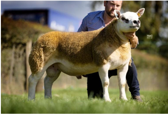
Rhaeadr First Choice