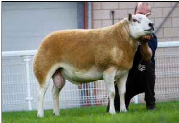
LOGIE DURNO BRAVEHEART

Purchased for 6000gns in 2019. He has produced a tremendous pen of shearling tups sold this time and left some very stylish females, with 6 of today's gimmers sired by him.