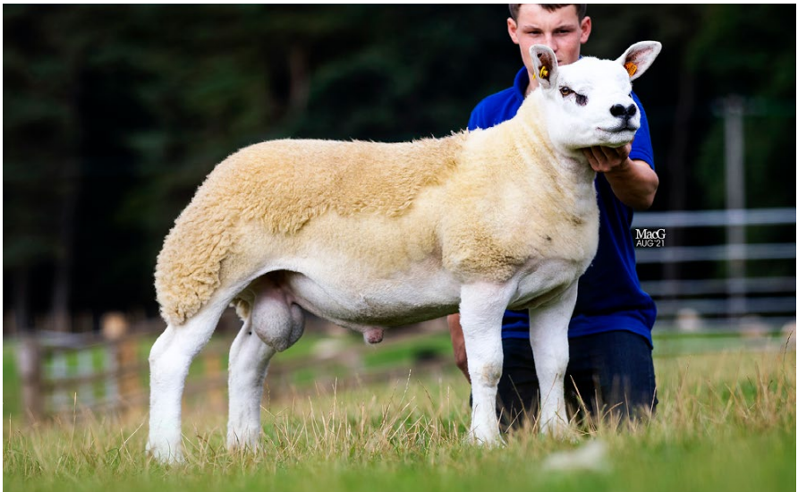
New View Electrifying 24,000gns