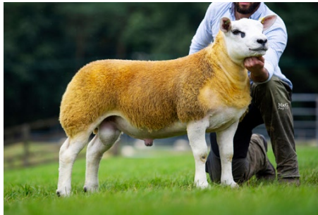
Usk Vale Cheeky Charlie - 36,000gns