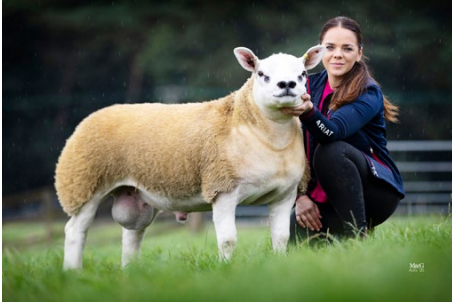
Sportsmans Double Diamond Record priced ram purchased jointly for 350,000gns. Our 1st crop of ram lambs sired by him at Lanark averaged £22905