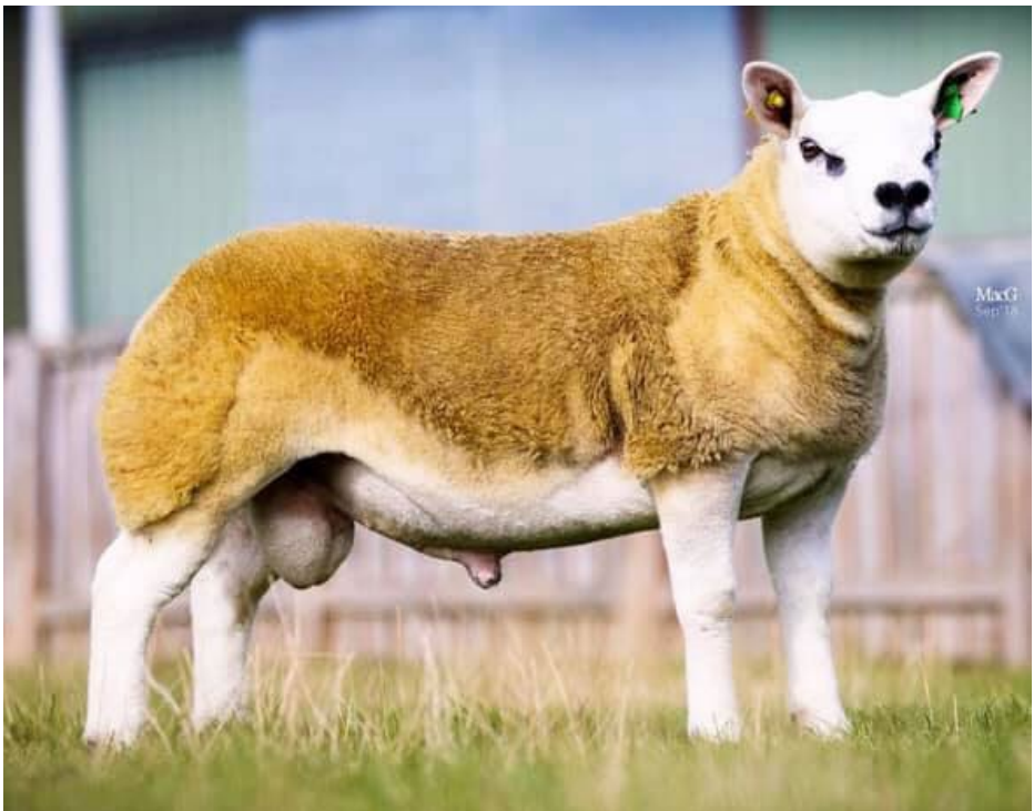
Teiglum Braveheart 24,000gns CFT18 05750

We wish all buyers success with their purchases, and thank everyone involved in the Crystal Maze sale. Tel 07707 811818