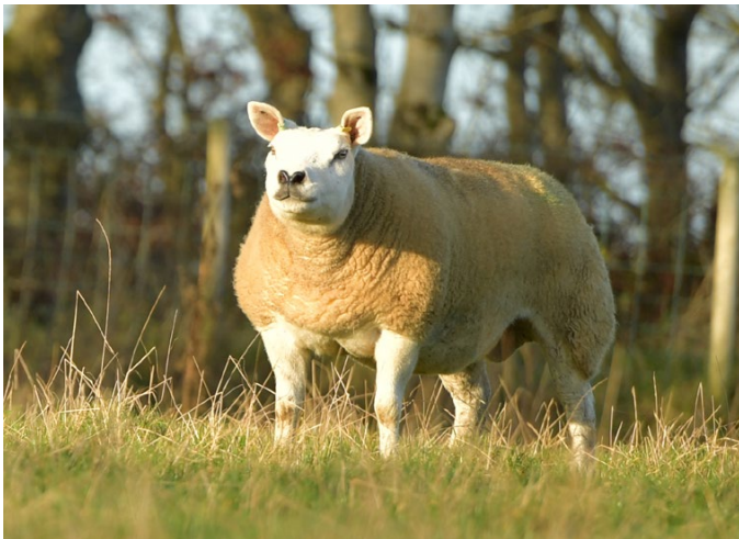
Dam of Lots 5 & 49