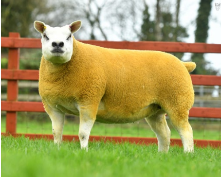
Maineview lot 27