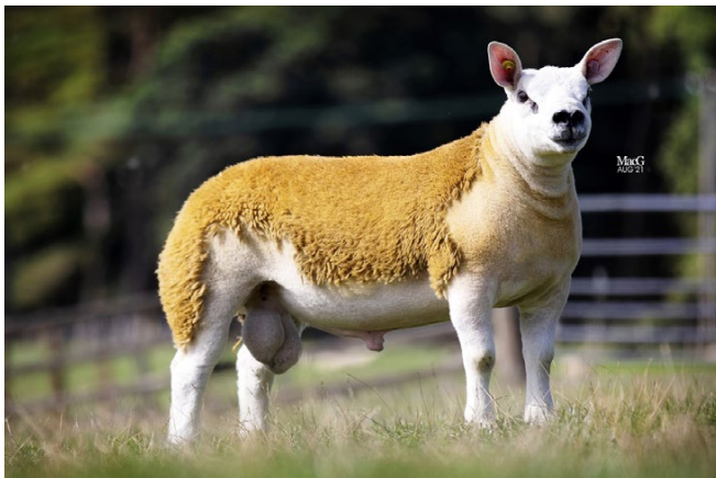
MILNBANK - SERVICE SIRE - HARESTONE ELDORADO 17K