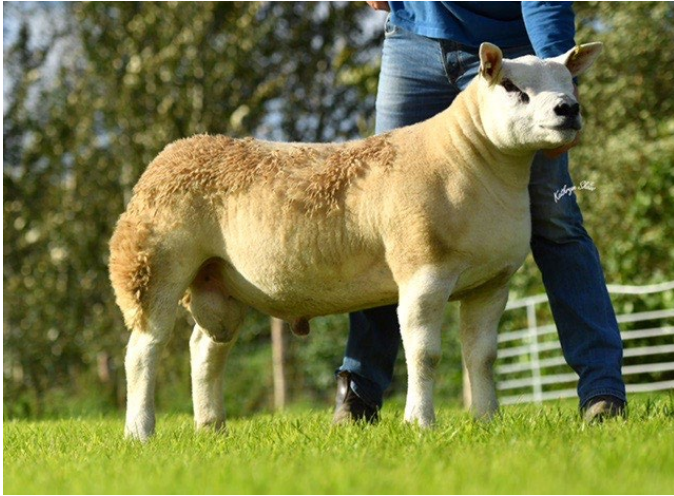
Kildowney Evo 5,800gns

This year I am pleased to offer for sale our entire crop of gimmers. This group of young females we believe is the best that we have ever offered for sale with great potential for the future. Mainly sired by 135k Sportsman A Star and a few sided by Knock Bantastic (who sired 200k Midlock Capaldi). We were excited to recently purchase a share in the much admired champion Kildowney Evo for 5,800gns and he is the service sire for most of the gimmer tonight. All gimmers have been vaccinated for Heptavac P, Toxo and Enzo. All gimmers are insured for three months over 600gns.