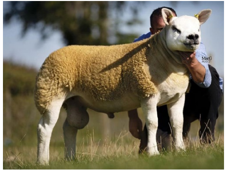
Lakeview earn your keep £18000