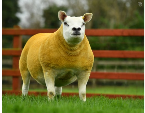
Maineview Lot 68