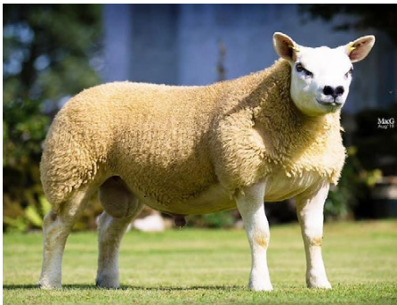
Knock crackerjack £30000