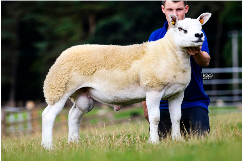
Service Sire: New View Electrifying 24,000gns