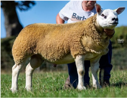
Cressage enforcer £38000