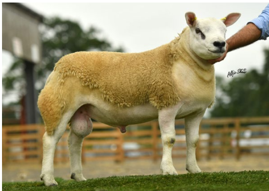
Alderview explosive 20,000gns