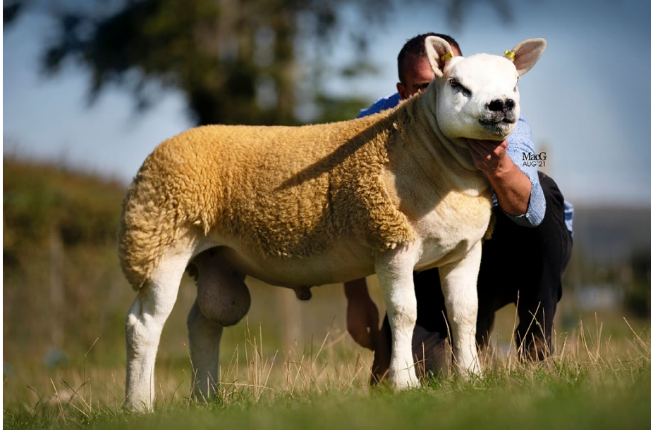
Service Sire: Lakeview Earn Your Keep-18,000gns

We look forward to seeing you all there.