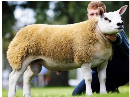
Sportsmans chieftain £8000