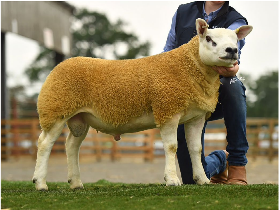
Mullan Eagle Eye sold 7500 gns, out of our great Herdman ewe. Same family as lots 23,24,25,67.jpg