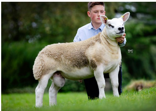
Lakeview service sire Castlecairn Doodlebug 38,000gns