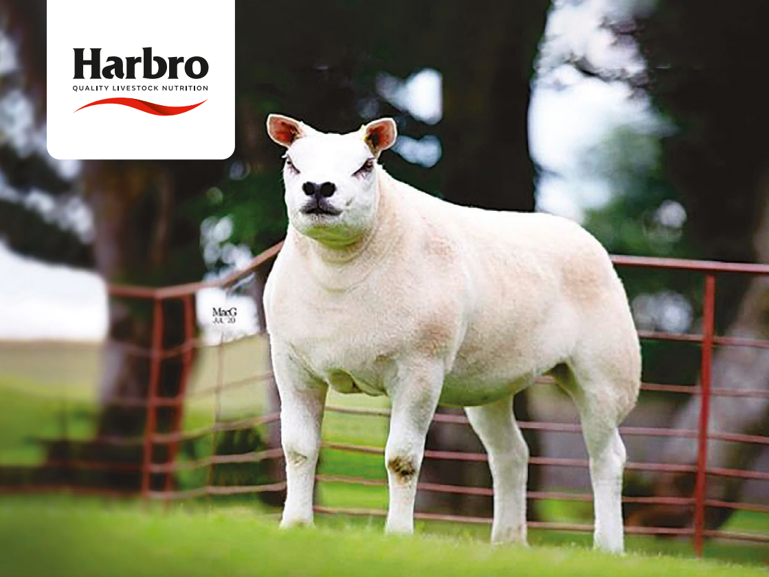
Milnbank Candy Crush