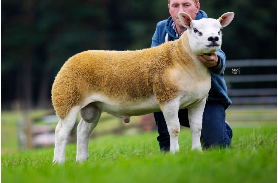
Sportsmans Cannon Ball 17,000gns