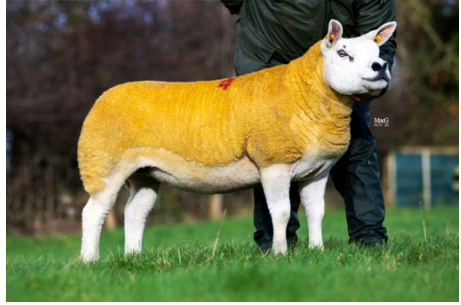
Sportsmans Batman. An exceptional breeder who sired the 46,000gns record priced gimmer Select 7 2020