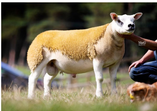
Glenside Emerald king 10,000gns