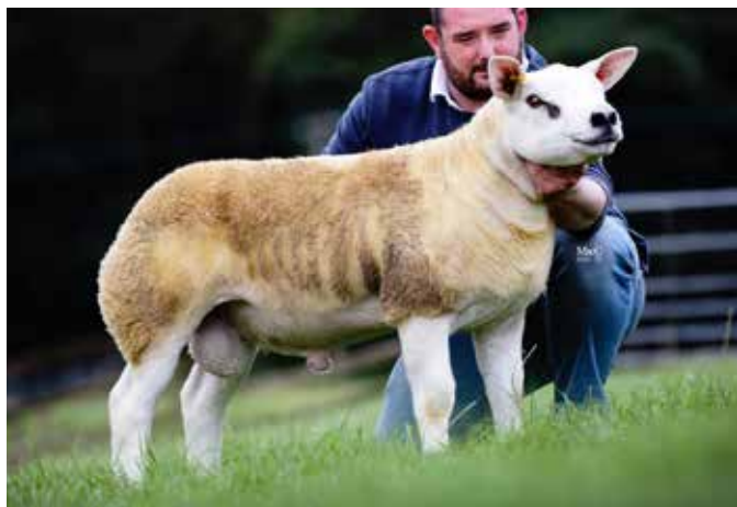
HEXEL DIAMOND JOE

Dam: IMP.042801402551(0) by DUNCRYNE UBER COOL JRV1300796(1)