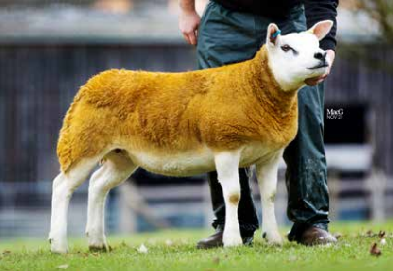
BFE-21-11101- LOT 456

Dam has bred progeny to gross over 50,000gns including ewe lambs to 7000gns, and ram lambs to 4500gns