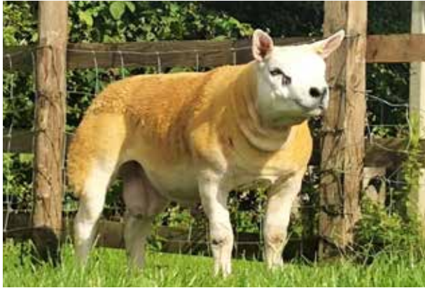
MILLARS EYE OF THE TIGER