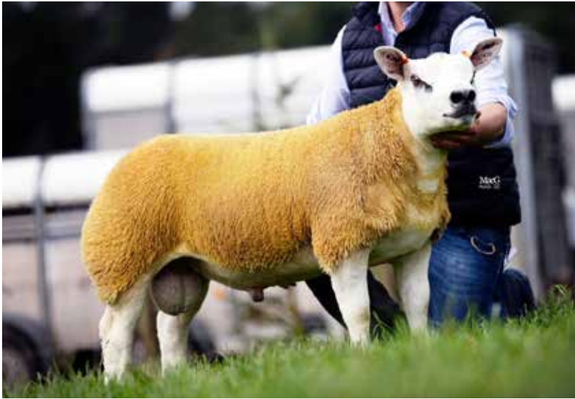
CRAIG DOUGLAS DANCER.

Dancer has grown into a massive ram and has bred sons to 70,000gns