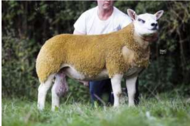
Dams sire 5,800gns Millars Abu Dhabi

A really classy, stylish ewe, tremendous lift & presence, a real favourite. Twin brother used as a lamb at Loosebeare and Dam by Millars Abu Dhabi purchased 5,800gns at Worcester, has bred females that sold to 2,600gns at last year's production sale. Reserve Overall Champion at English National. Going back to one of our favourite Langside The Gaffer daughters.