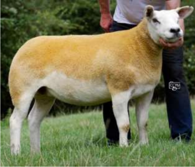
A Strawfrank Wild Thing daughter

STRAWFRANK WILD THING - Purchased Kelso '15. Son of 4K Tima Valentino-2nd prize recorded lamb Worc. Sire of our top priced ewe@ 1800gns here 2017. Also sired 2nd prize yearling ram @ English National sale '17 sold at 2300gns to the Coton flock, bred Interbred at Devon County Show 2017. In 2019 English National Sale 1 st Prize and sold for 7,000gns.