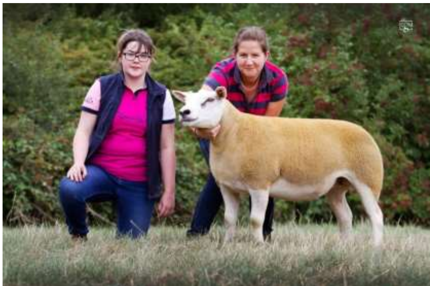
Top price Ewe 2018 sold to Onnen Flock