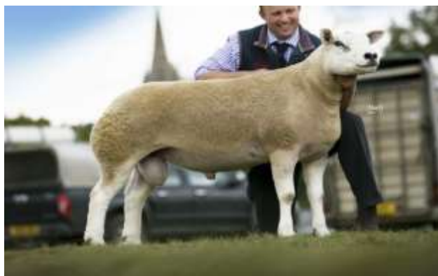
Brijon Youre The Boy – Sire to Lot 16

Outstanding backend. Dam by Loosebeare Voomer, who's top 30 offspring averaged over 3,000gns. Gt dam an enormous daughter of previous Bulth Champion Hendre Oh Boy.