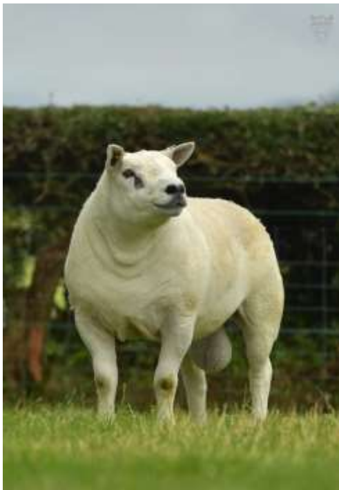
Loosebeare Chief – a Bulletproof son.

Extreme - with fantastic colours, the Dam by the Giant Whitehart Ultimate, a son of 7,800gns Cherryvale Shergar.