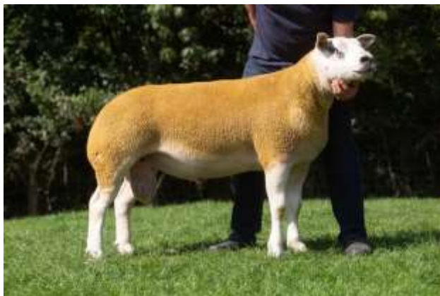
Son of Brijon You're the boy sold 7200gns

A very strong ewe. Dam sired by Brijon Youre The Boy, purchased for 5,800 and sired rams sold for 7,200 & 7,000gns.