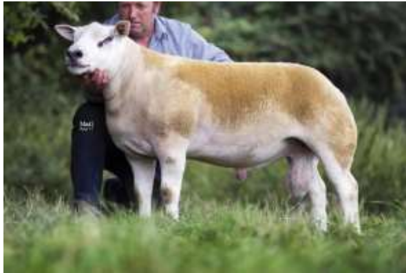
Voomer son sold to 5,300gns – Mortimer Flock

What better way to start the sale than with this sharp & excellent conformation yearling. Dams Sire, the influential Loosebeare Voomer, who sired countless show & sale toppers. To date sired ram lambs to 7,000 & 6,500gns, yearling rams to 6,500 & 5,300gns and ewes to 5,000, 4,700 & 3,300gns.