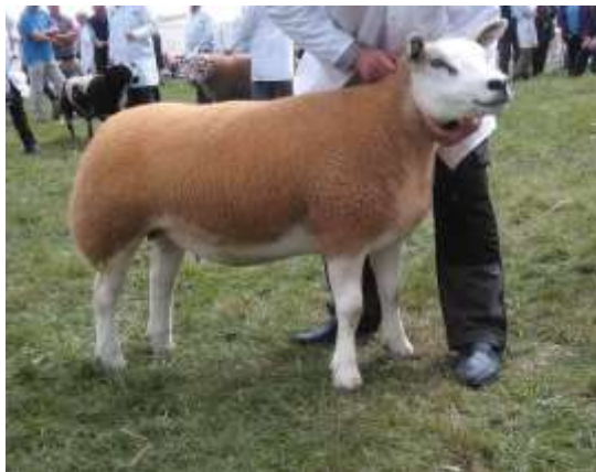
Dam Interbreed Champion at Okehampton show by Loosebeare Voomer

21 LOOSEBEARE QEL2010778(E1) Born: 04/03/2020 Sire: SPORTSMANS BULLETPROOF BGS1803224(1) by FORDAFOURIE AMALERT Dam: QEL1808873(2) by LOOSEBEARE VOOMER QEL1404580(E) A gimmer that just oozes class, style, tremendous length & from one of our best female families, its ET sister is being included in our flush team & this ewe is undoubtedly good enough to join anyone's flush team. Full ET brother sold for 3,500 and has done a great job in 2 pedigree flocks. The Dam our Show yearling who was Interbreed Champion at Okehampton, Dams Sire influential Loosebeare Voomer, Voomer has bred numerous sale & show winners and to date over 30 of his top off spring have averaged over 3,000gns. He has bred ram lambs to 7,000 & 6,000gns, Yearling rams to 6,500, 5,300 & 4,500gns and yearling ewes to 5,000, 4,700 & 3,300gns, all of which have been top prices at our Production Sale.