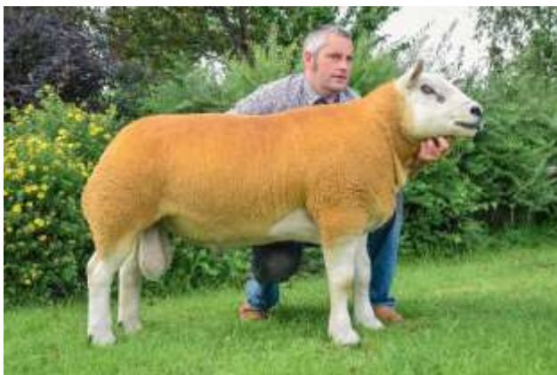
Dams sire the 5200gns Douganhill Whisky Mac

46 LOOSEBEARE QEL2010866(2) Born: 18/02/2020 Sire: SPORTSMANS BULLETPROOF BGS1803224(1) by FORDAFOURIE AMALERT Dam: QEL1707841(2) by DOUGANHILL WHISKY MAC GCK1507130(2) Powerful yearling, Dam by Douganhill Whisky Mac who was Interbreed Champion Royal Cornwall.