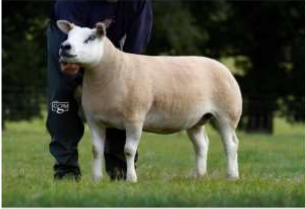
Top price Loosebeare Ewe 2020 at 5,000gns

We are delighted to offer 30 shearling ewes to this – our fourth Production Sale. I am sure the ewes on sale offer something to both new breeders starting & expanding flocks and to those looking for something special to flush.