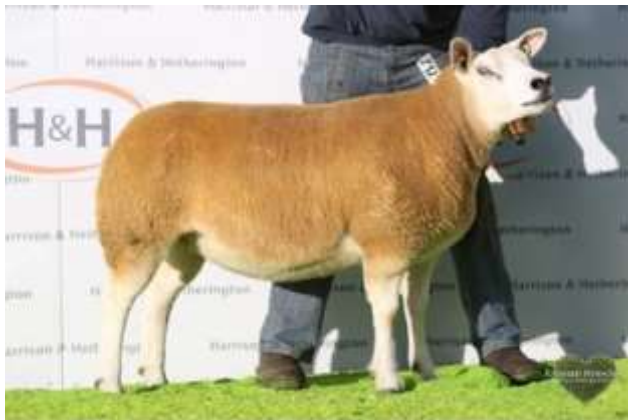
Loosebeare ewe who was dam of Halbeath Vip sold 6200gns