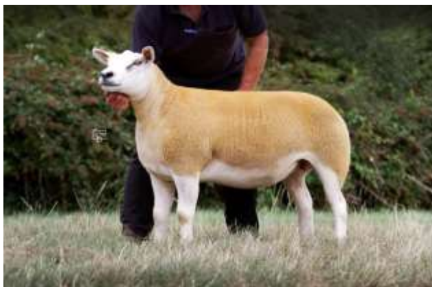
4700gns Voomer ewe

MISS N HARTWRIGHT WHITEHART 51 WHITEHART Sire: ARKLE CUBA WGA1905758(2) by ARKLE ALL STAR Dam: HWN1803787(2) by LOOSEBEARE VOOMER QEL1404580(E) A tremendous fleshed ewe whose Dam is by Loosebeare Voomer and Gt Dam bred Whitehart Classic sold for 4,400gns 2020. HWN2005174(2) Born: 10/03/2020