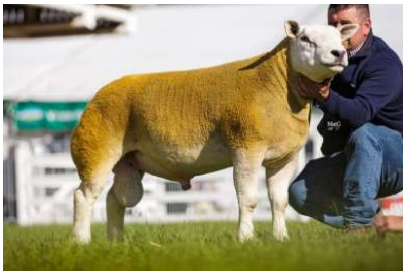
Pant Wolf sire of Crookholm Bouncer

CROOKHOLM BOUNCER – Best looking aged ram at Loosebeare. Having great presence & superb top and confirmation, his sire the 18k Pant Wolf. (Record price ram at Bulth NSA, sired by Loosebeare Unique)