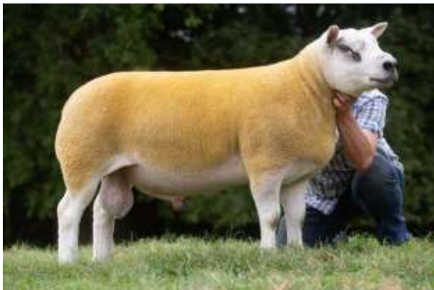
7000gns Whitehart Big Style sold to Willodge

A modern Cosmic daughter whose Dam is by Humeston River Dance who was a real star for us at Whitehart out of a fantastic female line that bred 7,000gns Big Style.