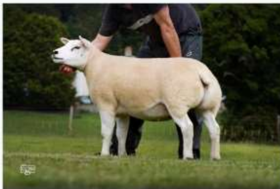
Daughter of A1 sold last year for 1800gns at production sale