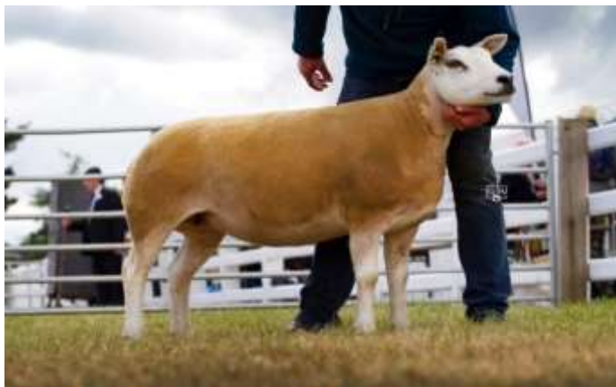
1 st Prize Royal Cornwall Show, sold to 1,700gns.

Dams Sire Loosebeare All Gold, son of high index Hollyford Vroom Vroom, All Gold bred ewes to 1,700gns and rams to 1,500gns, his daughter bred 7,200 Loosebeare Champion sold 2020 at Worcester. All Gold used as a lamb then sold for 1,700gns to Cwmbromley flock of G E Davies.