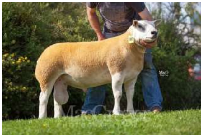
Loosebeare Unique 3500gns , son of Whitehart Taylor Made who sired 18k Pant Wolf

One of our favourites, can't miss her in the pen. Dam by Whitehart Taylor Made who sired rams to 3,500gns.