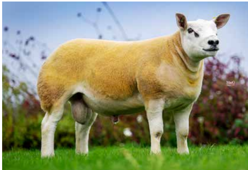
USK VALE CHAMPAGNE CHARLIE