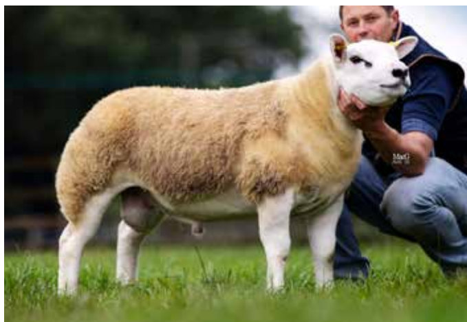
CASTLECAIRN DJ BAD BOY