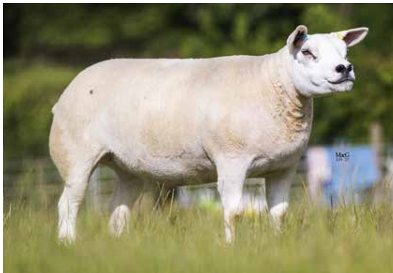
LOT 353 (Photo taken in June)

Dam is a 20,000gns Auldhouseburn CKC10 daughter. Dam's maternal sisters have bred rams to 125,000gns and 75,000gns. Sired by Sportsmans A Star.