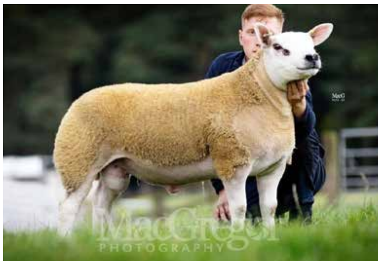
SPORTSMANS DEAL BREAKER

Sportsman's Deal Breaker was purchased at Lanark for 28,000gns.