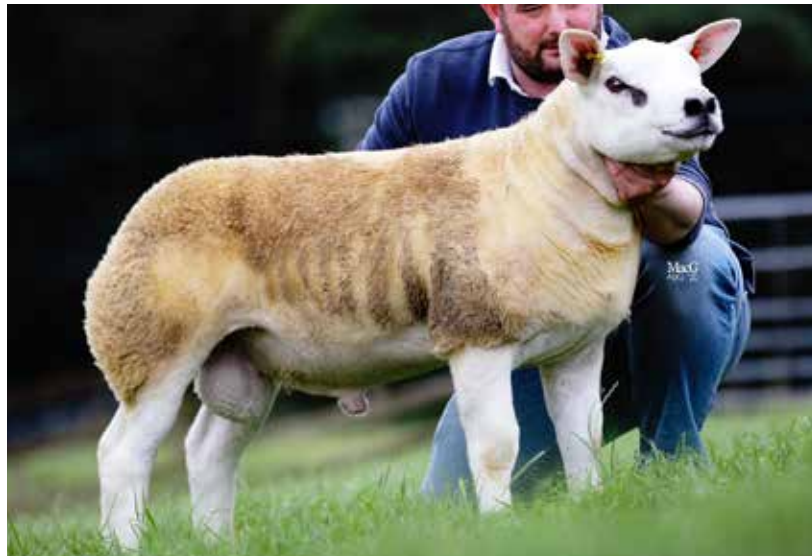
HEXEL DIAMOND JOE

Purchased for 14,000gns at Lanark, Full brother to 65.000gns ram.