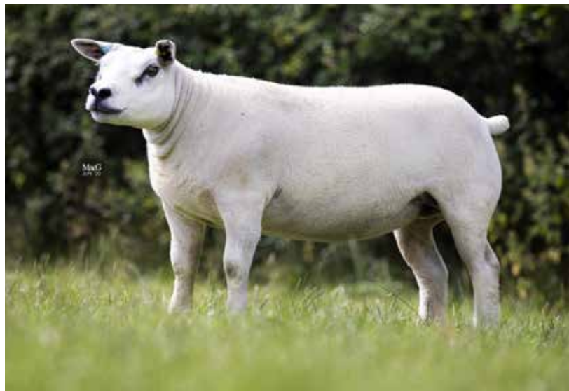
LOT 407 (Photo taken in June)

Dam is 10,000gns Twilight Sale topper 2018 and ET sister to 18,000gns Alys. Sired by 30,000gns Knock Yankee. Gdam is ET sister to retained VaVaVoom who bred progeny to 6500gns.