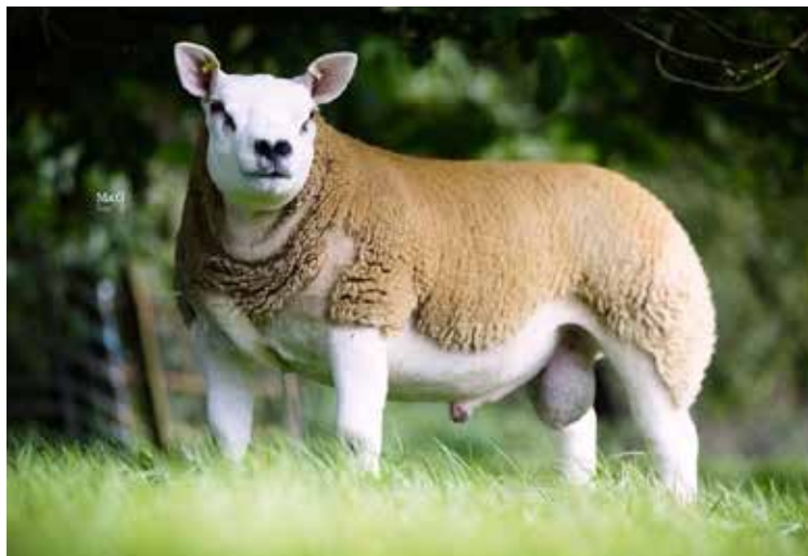
CLAYBURY BAD ASS

Dam: DHL1300651(3) by MELLOR VALE TOMAHAWK BCM1200139(E)