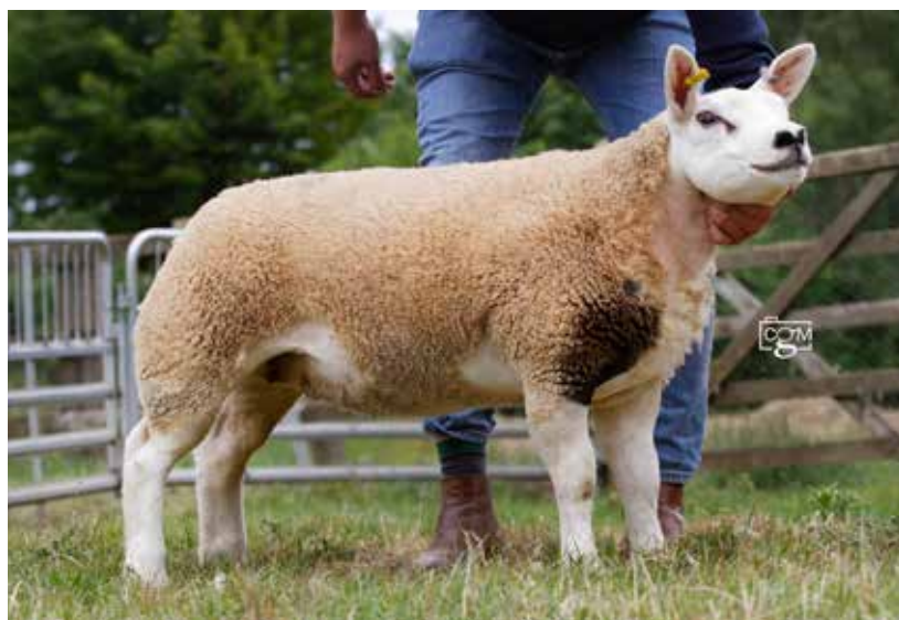
FULL SISTER TO LOT 438