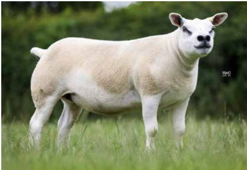
LOT 404 (Photo taken in June)

Dam is 17,000gns Auldhouseburn who is a grand daughter of CKC10. ET sisters have sold to 3800gns. Maternal brothers sold to 2000gns.