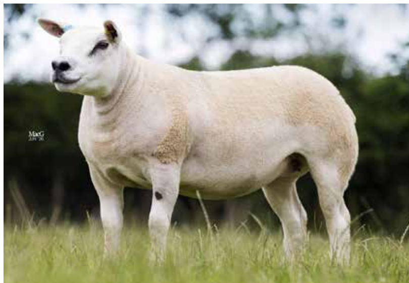
LOT 354 (Photo taken in June)

Dam is ET sister to 11,000gns All Star. From the same female line as 20,000gns Bossman.