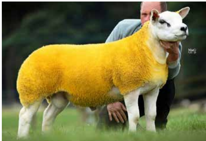
HAYMOUNT DIVINE KING son of Usk Vale Crackerjack

Purchased at Lanark for 13,000gns and has bred exceptionally well. Sons include 32,000gns Haymount Divine King and 12 sold to average 6500gns this season.