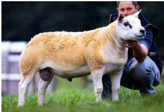
KNAP DESPERATE DAN