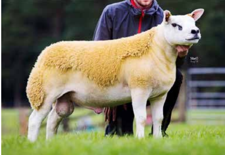
COWAL BUCKING BRONCO