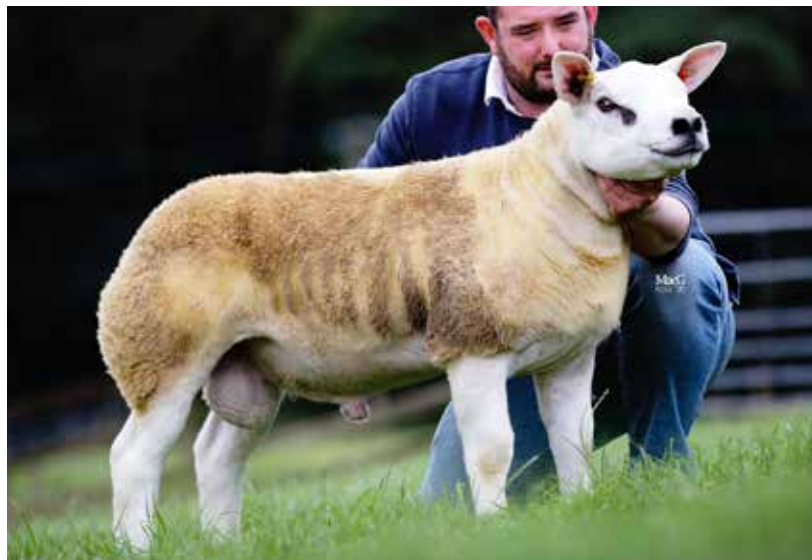
HEXEL DIAMOND JOE

Purchased for 14,000gns at Lanark. Full brother to 65,000gns ram.