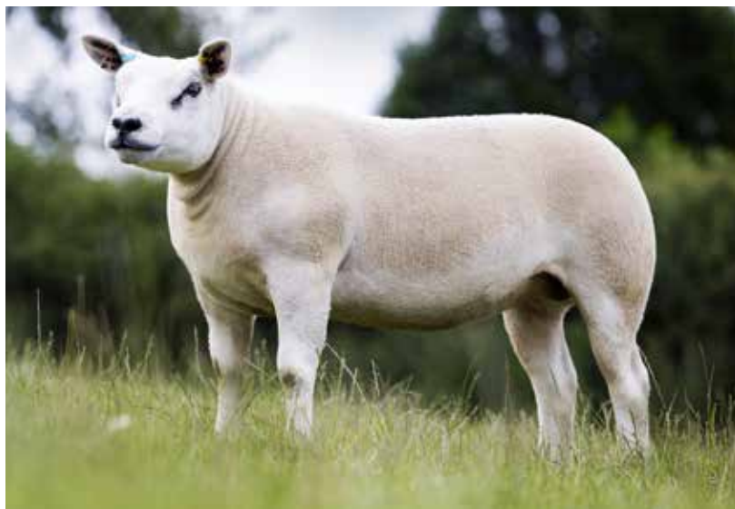
LOT 351 (Photo taken in June)

One of this year's favourites. ET sister to 3500gns Charmer. Dam is the best breeding ewe in the flock who bred 7000gns Twilight ewe lamb, 4500gns Donny Brasco and many other progenies selling for 4 figure prices. Dam is also maternal sister to the dam of 32,000gns Big Gun.