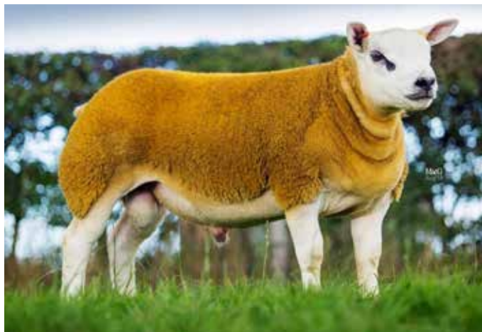
PLASUCHA BOSS MAN

Purchased jointly at Lanark for 20,000gns. Sons include Haymount Crackerjack who sired 38,000gns Castlecairn Doodlebug.