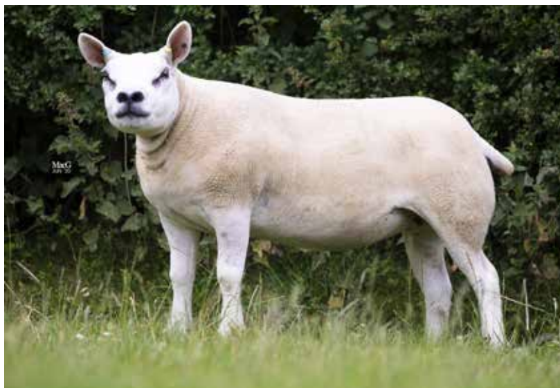
LOT 406 (Photo taken in June)

ET sister to 7500gns Coming King. Dam purchased privately from Auldhouseburn.