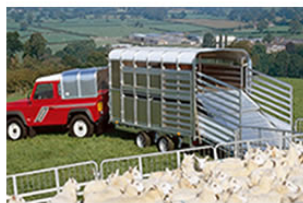
Ifor Williams Livestock Trailers

Brochures Available for Download or call 01772 600395