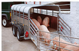
Ifor Williams Sheep Trailers