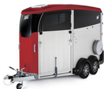
New Ifor Williams Horsebox Trailers