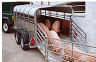
Ifor Williams Sheep Trailers