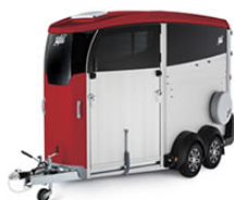
New Ifor Williams Horsebox Trailers