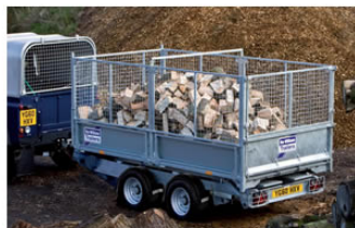
Ifor Williams Tipping Trailers