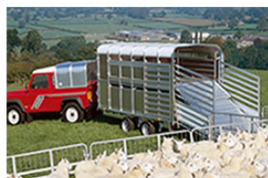
Ifor Williams Livestock Trailers

Brochures Available for Download or call 01772 600395