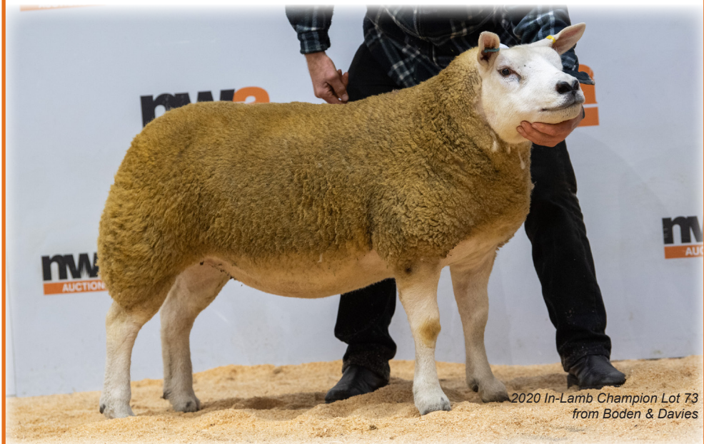
2020 In-Lamb Champion Lot 73 from Boden & Davies

Show Classes for Aged Ewe - Warranted In-Lamb Shearling Ewe - Warranted In-Lamb Ewe Lamb - Warranted Empty