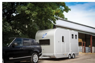
Eventa Horse Trailers with Living