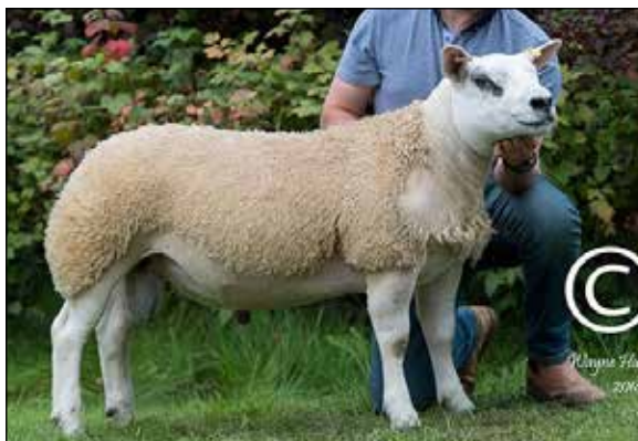
BALTIER BARON I

Purchased for 5000gn Solway and Tyne 2019.