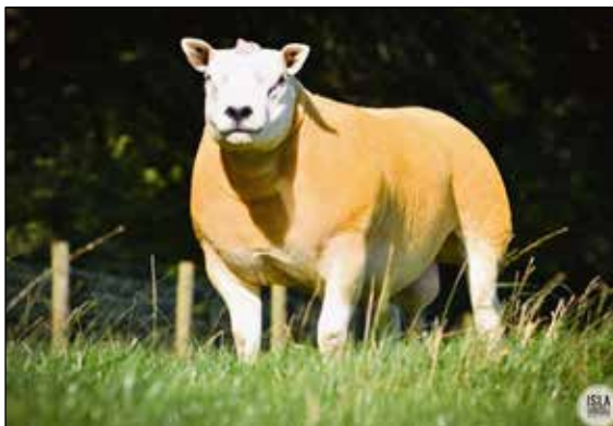
GREENALL BILLY WHIZZ

In the past four years gimmers have bred rams to £5000, £4400, £3600, £2100, £2000 and £1800.