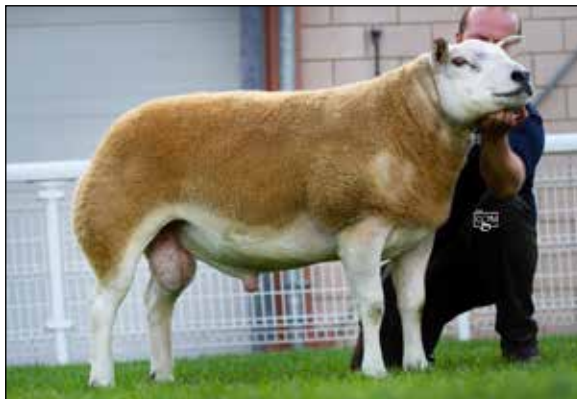
LOGIE DURNO BRAVEHEART

Dam: IGB1410262(2) by LIVERY ULTIMATUM VTL1300307(E)