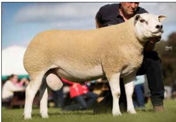
£7000 LOOSEBEARE SHEARLING

Loosebeare Texels are pleased to bring a consignment of strong shearling gimmers, all are carrying great tops and ends and from some of our best bloodlines, we were pleased to have achieved the top pen average at Kelso of £2216, and sold to a top of £7000.