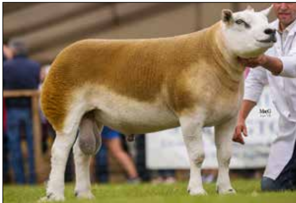
MIDLOCK YOURE THE ONE

Jointly purchased for £23,000, highest priced Texel Kelso 2017, a son of 18,000gn Sportsmans Unbeatable.