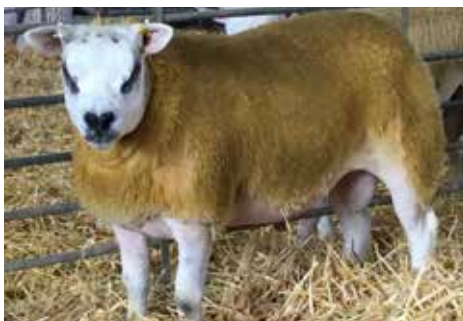
EDEN VALLEY CANNON BALL

Won 4th prize ram lamb Great Yorkshire show 2019, 1st prize Appleby Show 2019. ET sister won 1st prize J36 and sold for 2000gns. He has been retained in the flock as a stock ram.