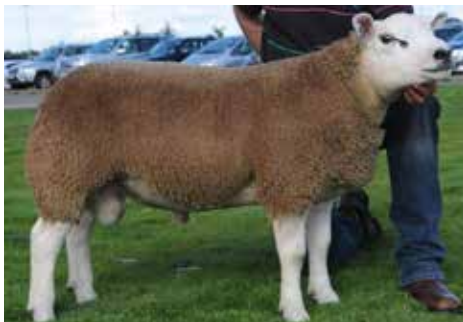
CAMBWELL ROB ROY

Purchased for 40,000gns. Sired lambs to 8500gns and many more high prices rams and gimmers.