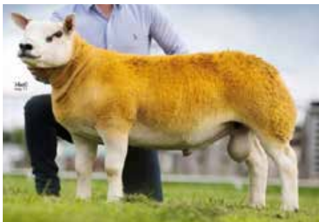
PLASUCHA ALL STAR

Sons have sold to 32,000gns, and daughters to 9000gns.