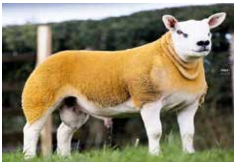
PLASUCHA BIG GUN

An ET sister to 32,000gn Plasucha Big Gun. Gdam bred Plasucha Aberfeldy, and is from one of the best breeding families in the flock.