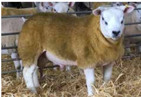
EDEN VALLEY CAPTAIN AMERICA

Won 1st prize ram lamb Great Yorkshire show 2019, and sold for 3500gns Carlisle 2019. He was kindly loaned back to the flock for AI and Flushing.