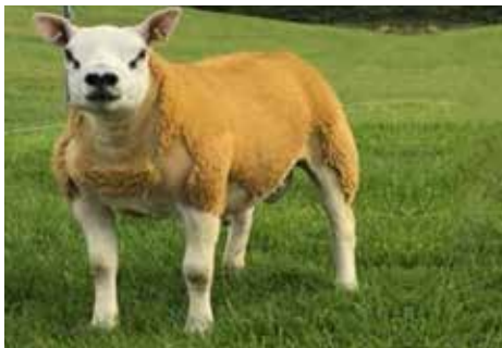
FAR HEY CANNONBALL

Won 1st prize Great Yorkshire show 2019.