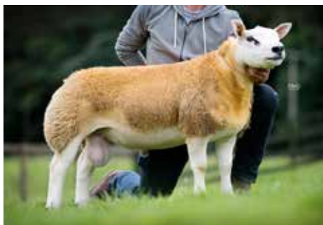
ARKLE YOU BET Maternal brother to Lot 366

VENDOR HAS TAKEN 6 EMBRYOS AND HAS RETAINED FOR OWN USE