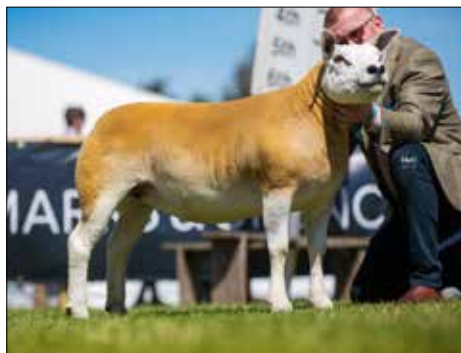
PLASUCHA ALYS - ET SISTER TO LOT 430

Reserve Texel Champion Shropshire County Show 2018, ET sister to 18,000gn Plasucha Aly's. Dam is ET sister to retained stock ram Plasucha Vavavoom who bred progeny to 6500gns. Gdam Plasucha Tutu won 2nd prize aged ewe RWAS 2015. 3dam won Reserve Female Champion RWAS 2013.