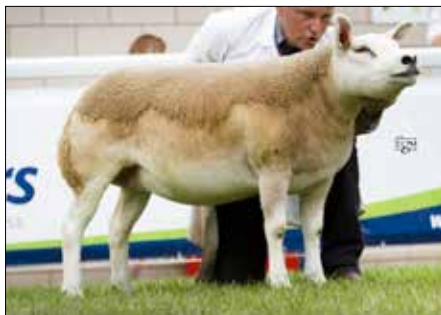
DAM OF EMBRYO OF LOT 446

This embryo could be something special. The dam of this embryo is Welsh Queen, Champion RWAS 2018. The sire of this embryo is Milnbank Brisbane who was purchased for 5500gns Carlisle 2018. This embryo would be an asset to any established or new breeder. We hope we are selling another Show Champion.