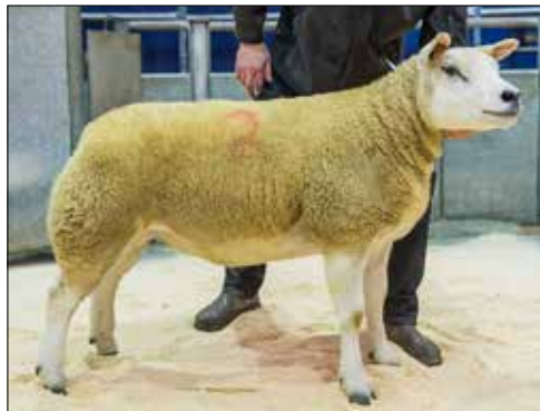
DAM OF LOT 353

Another daughter of 24,000gn Midlock Yorkie, who has sired rams to 3200gns. Her dam sold for 3200gns Twilight Sale 2016. An ET sister has been retained in the flock.