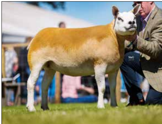
PLASUCHA ANNABELLE – ET SISTER TO LOT 434

ET sister to Plasucha Annabelle 1st prize gimmer GYS 2018. ET sister to 6000gns Plasucha Action Man.