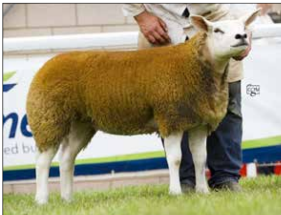
DAM OF EMBRYOS OF LOT 398

Dam of this embryo won 1st prize ewe lamb RWAS 2018, she is the best ewe lamb ever bred in the flock, full of character and power. She is sired by Strathbogie Ya Patch who has bred very well in the flock. Milnbank Brisbane (sire) has extreme carcase and skin. This is a very exciting pregnancy.