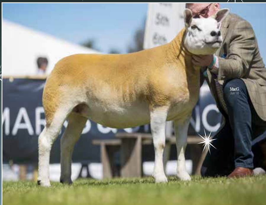
Plasucha Alys 18,000gns – ET sister to Lot 430 & 437