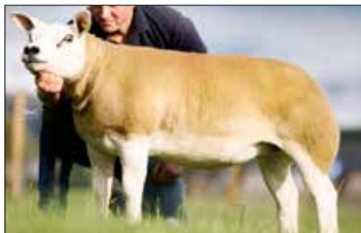
DAUGHTER OF BRYN-Y-COED YOGI BEAR

Reserve Champion Lanark who sold for 4800gns.