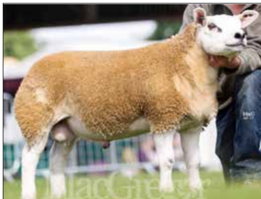
EDEN VALLEY A1

Bred very well in his first season across 4 flocks, two of the flocks ewe lambs won 2nd prize and 4th prize Great Yorkshire Show 2018.