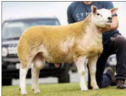
BRYN-Y-COED YOGI BEAR

Bred Reserve Champion Lanark who sold for 4800gns.