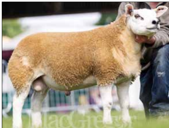
EDEN VALLEY A1

Bred very well in his first season across 4 flocks, two of the flocks ewe lambs won 2nd prize and 4th prize Great Yorkshire Show 2018.