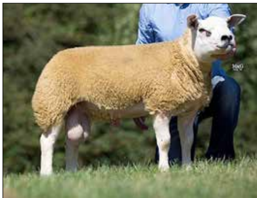
STRATHBOGIE YA PATCH

A sire that needs no introduction! Has done a tremendous job in both the Llangwm and Welsh flocks, he was the sire of the gimmer that won Champion RWAS 2018, and sire of 1st prize ewe lamb RWAS 2018. He was sire of 1st prize lamb ram and Male Champion RWAS 2017. His first crop of gimmers are very tight skinned long and solid.