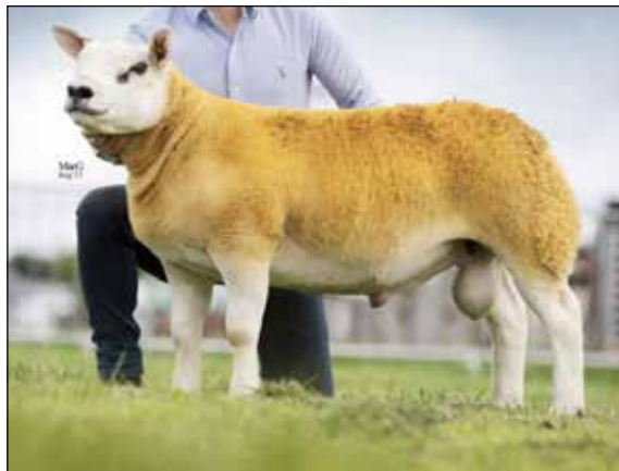
PLASUCHA ALL STAR - ET BROTHER OF LOT 436