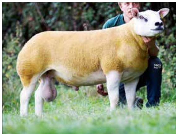
PEACEHAY YA BELTER

Purchased for 23,000gns Worcester Sale 2017, with Langside and Meonside flocks.