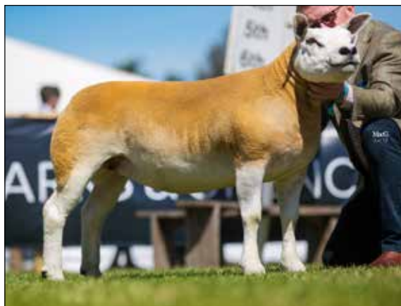
PLASUCHA ALYS - ET SISTER OF LOT 437