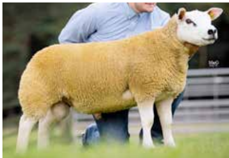
CLINTERTY YUGA KHAN

Sire: TOPHILL WALL ST by PROCTERS VENTURA PFD1403565(E) Dam: BBY1300508(E) by ETTRICK SMASHER GGH1101110(E) GDam: BBY07301(2) by ETTRICK MIGHTY MOUSE GGH06167(E) GGDam: BGS05105(3) by HADD0 KNOXIE KWWJ04424(1)