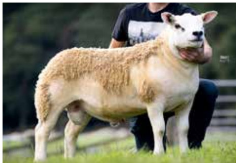
AULDHOUSEBURN BILLY THE KID

Purchased for 28,000gns, his dam was a very good 13,000gn Hullhouse gimmer.