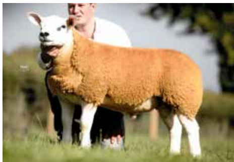
ETTRICK BRAW LAD

Won 7th prize open single lamb Lanark 2018 and purchased for 7500gns. Dam won Champion of Champions Kelso Show 2014. ET brother sold for 7000gns. Maternal brother won Champion Carlisle Sale 2017. Maternal brothers sold to 6000gns, 4000gns twice.