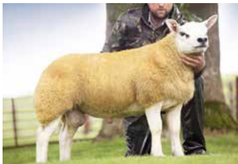
STRATHBOGIE YES SIR

Purchased for 60,000gns, and has bred rams to 17,000gns, and females to 20,000gns and 16,000gns. He has also sired Female Champion and Reserve RHS 2018.