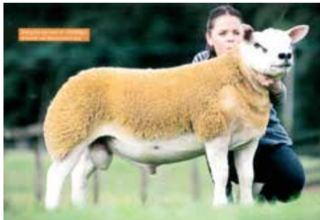
SPORTSMANS A STAR

Jointly purchased for 130,000gns. He won Sire of the Year 2018.