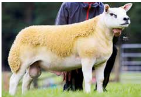
COWAL BUCKING BRONCO

Purchased for 22,000gns, his dam is the huge 12,000gn Knap gimmer.