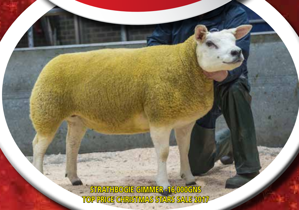
STRATHBOGIE GIMMER -16,000GNS TOP PRICE CHRISTMAS STARS SALE 2017