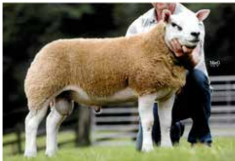
STANTON YOU BET

Purchased for 7000gns and sired 24,000gn Fordafourie Amalert who sired lambs to 26,000gns this year.