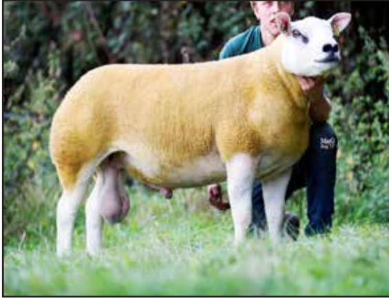
PEACEHAY YA BELTER

Purchased jointly for 23,000gns Worcester 2017. Probably the best shearling ram seen in years and he was a must buy on the day.