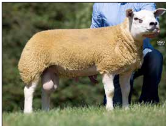
STRATHBOGIE YA PATCH

STRATHBOGIE YA PATCH IJS1600759(E) Born: 20/02/2016 Sire: MILLAR'S WINDBROOK by KNAP VITAL SPARK CKP1400079(3) Dam: IJS1400616(E) by STRATHBOGIE UNTOUCHABLE IJS1300280(E) GDam: CUB1000051(2) by SPORTSMANS PASTERNAK BGS09010(1) GGDam: CUB07096(1) by DEN BURG 03884-03647(2)