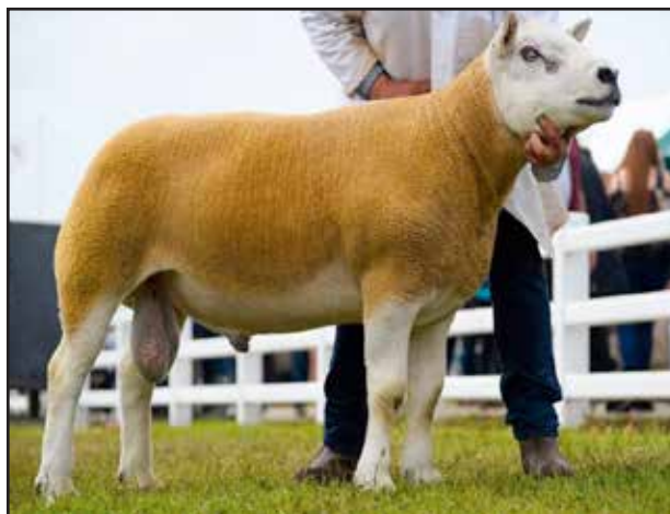
DOUGANHILL WHISKY MAC

Purchased for 5200gns at Carlisle. Won Interbreed Champion Cornwall Show 2017.