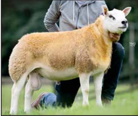
ARKLE YOU BET Full brother to lot 449

A stock gimmer, ET sister to 20,000gns Arkle You Bet. A great family, dams maternal sister sold for 5000gns Twilight Sale 2016.