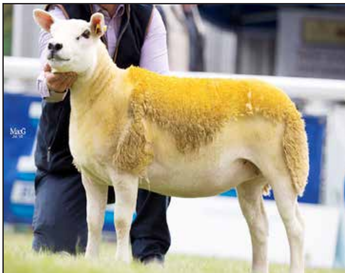
WELSH YOUR THE GIRL - Maternal sister to lot 465.

What an opportunity to have on offer! This embryo is a maternal brother or sister to 2200gns Welsh Your the Girl and her 2000gns sister. The dam has bred terrifically well so far for the Welsh flock. She is full of power and character and is breeding true to type. The sire of the embryo, Baltier Vampire, needs no introduction and we are eagerly awaiting his offspring . This embryo should turn some heads with the breeding behind it.