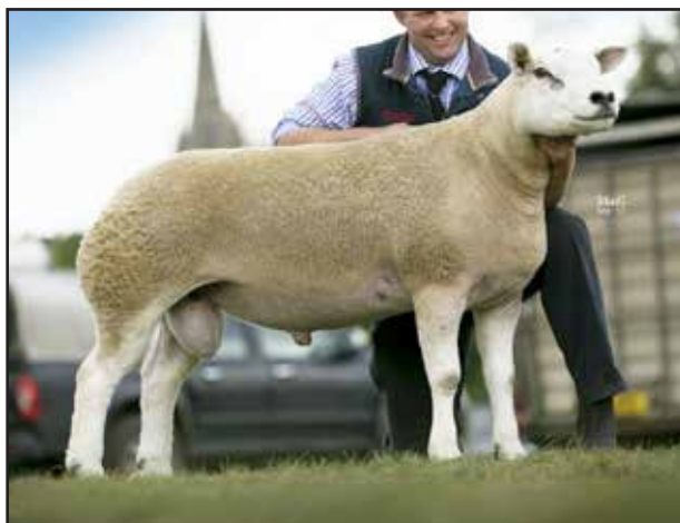
BRIJON YOURE THE BOY

Purchased for £5800 jointly with the Whitehart Flock.