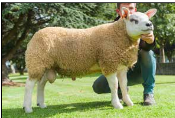
HEXEL WILD BILL

Sire: CAMBWELL TAURIS by SPORTSMANS SUPREME BGS1100303 (E) Dam: MZH1200144 (E) by GLENSIDE RAZZLE DAZZLE FPG1000055 (E) GDam: MZH1000023 (E) by DOUGANHILL MC FLY GCK06073 (1) GGDam: MZH05007 (E) by DOUGANHILL JERONIMO GCK03034 (2) Purchased for 14,000gns, Solway & Tyne Texel Club Sale 2015.