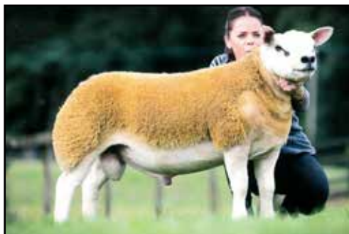
SPORTSMANS A STAR - 130,000gns

SPORTSMANS A STAR BGS1702642(E) Born: 10/02/2017 Sire: TEIGLUM YOUNGGUN by TEIGLUM WINDFALL CFT1503945(E) Dam: CKC1303034(E) by CAIRNAM TALISMAN GCF1201109(E) GDam: CKC1100256(E) by KELSO PAVAROTTI MBZ09002(E) GGDam: CKC08647(E) by MUIRESK NORTHERN DANCER MSK07634(2) Jointly purchased jointly for 130,000gns