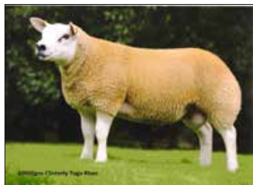
CLINTERTY YUGA KHAN

Sire: TOPHILL WALL ST by PROCTERS VENTURA PFD1403565(E) Dam: BBY1300508(E) by ETTRICK SMASHER GGH1101110(E) GDam: BBY07301(2) by ETTRICK MIGHTY MOUSE GGH06167(E) GGDam: BGS05105(3) by HADD0 KNOXIE KWJ04424(1)