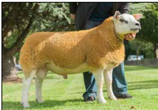
GLENSIDE WILD BOY

Purchased for 12,000gns and has bred sons selling to 42,000gns, 13,000gns and 12,000gns.