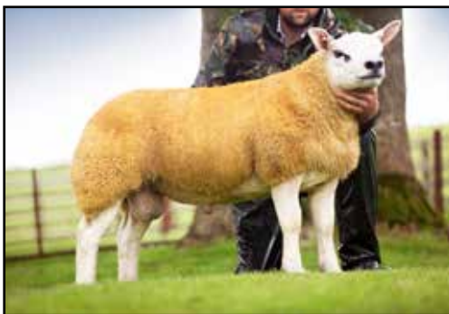
STRATHBOGIE YES SIR

Purchased privately for £60,000, and has bred very well in his first year, with his top 10 sons averaging £4500. He also sired 1st prize ewe lamb RHAS 2017.