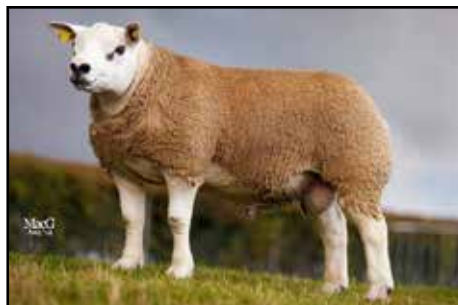
CORNMORE VELVET JACKET

CORNMORE VELVET JACKET LTE1400381(E) Born: 14/02/2014 Sire: TULLYLAGAN TONKA by MELLOR VALE SENATOR BCM1100066(E) Dam: LTC100520(1) by SEEOCH RINGMASTER BRQ1000010(1) GDam: LTC083126(1) by CAMBWELL LAIRD LTC05507(2) GGDam: LTC01053(2) by CRAILLOCH GOLDEN EYE MAE00031(3) Jointly purchased jointly for 85,000gns