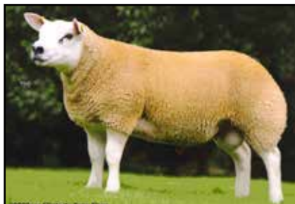
CLINTERTY YUGA KHAN

This stock ram has had a great influence within the flock on both rams and females.