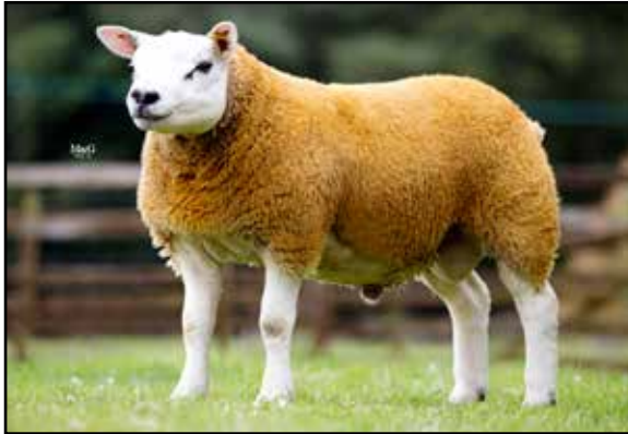
GLENSIDE WILLY NILLY

Purchased for 16,000gns and has bred sons to 14,000gns and 13,000gns, he also bred RHAS Champion 2017.