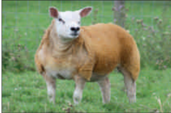
WELSH WHAT A GIRL - LOT 413

413 WELSH ESW1500455(E) Born: 18/02/2015 Sire: GLENSIDE VALHALLA FPG1400768(E) by STRATHBOGIE UPPING THE ANTE IJS13002 Dam: QDA1000028(E) by MULLAN PHOTOGENIC HBN09022(E) GDam: GRS06029(1) by RAMS LIGHTHOUSE GGG05001(2) GGDam: GRS04046(2) by STONEBRIDGE JAMES BOND RSS03001(1) EBVs: Litter Size 8 Wk Wgt Maternal Scan Wgt Musc Dpth Fat Dpth CT Gigot Musc Index 0.12 3.57 kgs 0.54kgs 8.17 kgs 0.88 mm -0.54 mm 4.09mm 255 Accuracy 42% 59% 22% 62% 59% 61% 55% 61% Welsh What a Girl has been a star from birth and has not left the farm until today. She has been greatly admired by visitors and so the hard decision has been taken to offer her for sale. An Embryo sister has been retained within the flock. Welsh What a Girl has been flushed and 2 frozen embryos will be sold with her by the flocks new stock ram Cornmore Weed Hopper (4500gns).