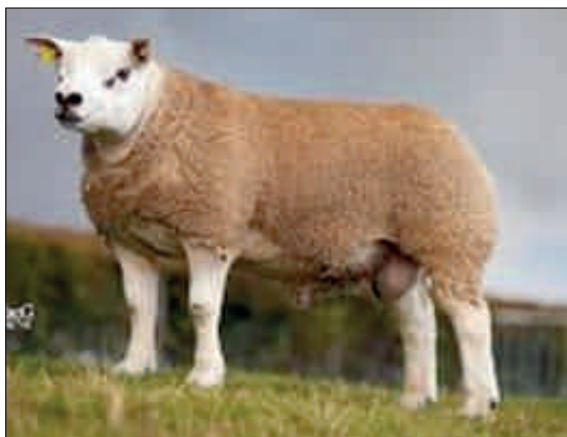
CORNMORE VELVET JACKET

Has the same presence and style of his maternal brother, the 85,000gn Cornmore Velvet Jacket