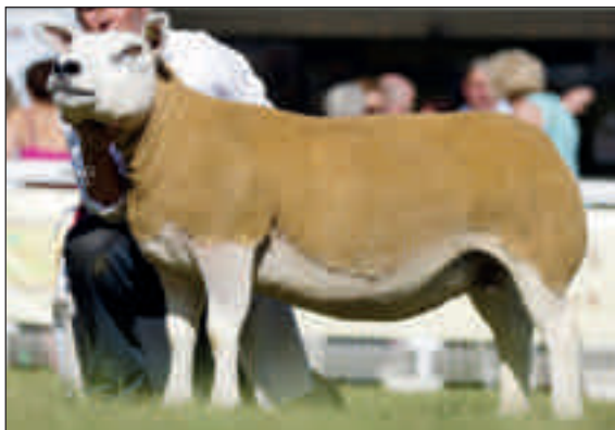
PROCTERS SEXY LADY

Sire: TOPHILL UNION JACK HPH1300527(1) by KNOCK TRIDENT HAK1200387(E) Dam: PFD1201948(E) by SPORTSMANS SCANIA BGS1100214(E) GDam: JKA08043(E) by ETTRICK MCCOIST GGH06073(E) GGDam: JKA03047(2) by CASTLECAIRN IRN BRU RNA02047(E) EBVs: Litter Size 8 Wk Wgt Maternal Scan Wgt Musc Dpth Fat Dpth CT Gigot Musc Index 0.16 2.71 kgs 0.11kgs 6.91 kgs 2.01 mm -0.24 mm 2.60mm 253 Accuracy 44% 70% 29% 76% 70% 74% 63% 74% Service Sire: KNAP WOT A NUT by CHARBEN VALENTINE VBC1401208(E) Service Details: AI'd 25/09/2015 Gdam bred Procters Sexy Lady Overall Texel Champion RWAS 2014.