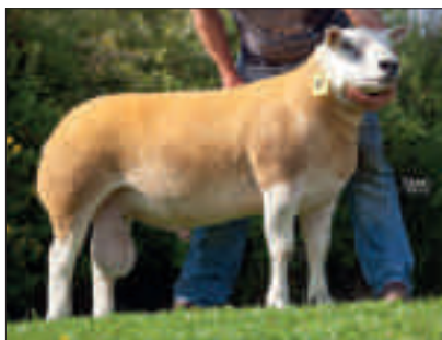
LOOSEBEARE UNIQUE (a son of Whitehart Taylor Made)