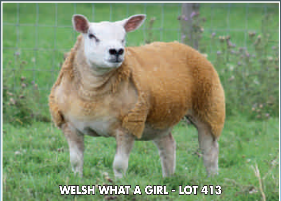
WELSH WHAT A GIRL - LOT 413