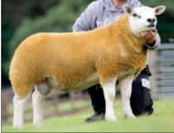
GLENSIDE WHISKEY GALORE

Sire: CORNMORE VELVET JACKET by TULLYLAGAN TONKA HPY1200404(E) Dam: FPG1100242(E) by STRATHBOGIE PYTHON IJS09289(E) GDam: FPG02096(3) by GLENSIDE HIS NIBS FPG01001(2) GGDam: FPG97002(2) by MUIRESK BLONDIN MSK95017(3) Purchased for 15,000gns, and sired by 80,000gn Cornmore Velvet Jacket.