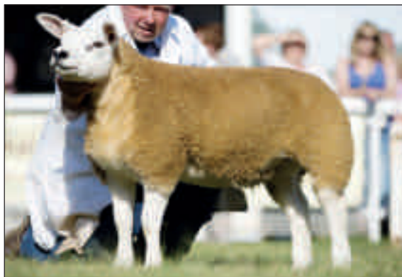
PROCTERS VICKI (dau. Anglezarke Uno) 2nd prize GYS &amp; 1st prize RWAS 2014. Full sister to Lot 365