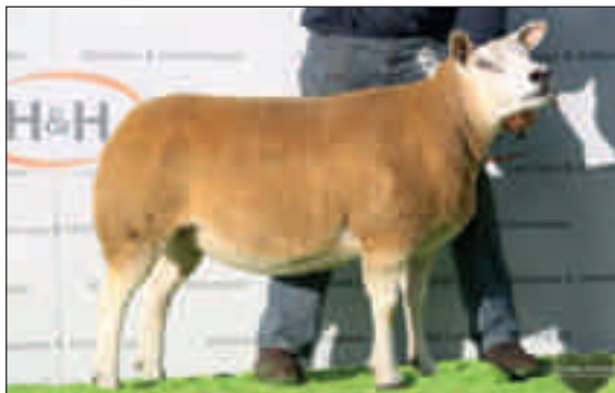
GIMMER SOLD FOR 6000GNS Twilight Sale

A very smart headed gimme. Dam won 1st prize Devon County Show 2013, she is full sister to Loosebeare Romeo, Loosebeare Red and 6000gn gimmer Twilight Sale.