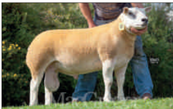
LOOSEBEARE UNIQUE (a son of Whitehart Taylor Made)

A tremendous bodied gimmer. Dam is by 7200gn Peacehay Masterpiece Champion RASE