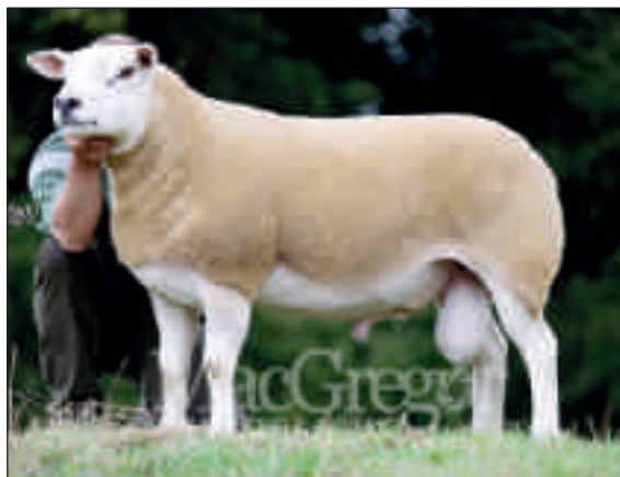
WHITEHART ULTRA MODERN

A long clean ram, son of 7200gn Cherryvale Shergar, purchased for 2500gns top price English National Sale 2014.