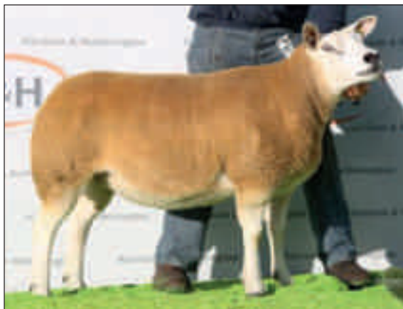
GIMMER SOLD FOR 6000GNS Twilight Sale

A triplet daughter of Mossknowe United. Her dam is another full sister to Loosebeare Romeo, Loosebeare Red and 6000gn gimmer Twilight Sale.