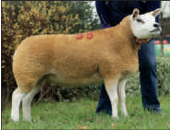
Top priced gimmer Twilight sale 2014 PFD13 02744

Congratulations must go to Will & Liz McCaffrey on purchasing the flocks PFD13 02744 for 4400gns, top priced Twilight Sale gimmer 2014. Her offspring going on to win 1st prize ewe lamb and Reserve Female Champion RWAS 2015.