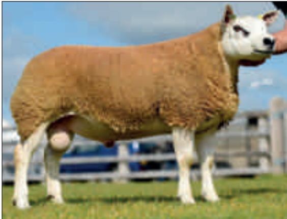
KNAP WOT A NUT

Sire: CHARBEN VALENTINE by STRATHBOGIE TERMINATOR IJS1200069(E) Dam: YSM1101598(2) by GARNGOUR ONYX C.JN085579(E) GDam: YSM090015(3) by MIDLOCK NUTCRACKER WKM07026(1) GGDam: YSM07008(2) by CONNACHAN MR MAJESTIC YSM06001(2) Reserve Overall Champion Carlisle 2015, purchased jointly for 5000gns.