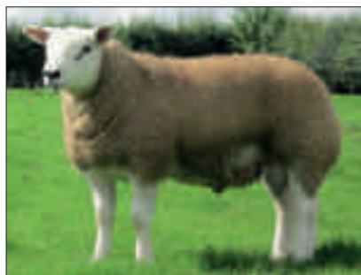
WHITEHART TAYLOR MADE (as a lamb)

Sire: HUMESTON RIVER DANCE GIH1000033(1) by NEWHILL PRESIDENT WNA09487(2) Dam: HWN1000188(2) by HENDRE LIONHEART SJE05116(2) GDam: HWN08803(2) by DIDCOT JUPITER HKW03002(1) GGDam: HWN06368(2) by BROOMKNOWES LION KING GWB05110(2) Has bred rams selling to 3500gns.