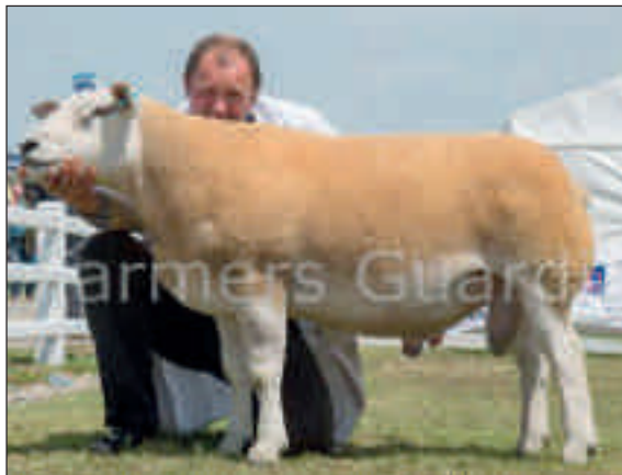
CAEREINION TOP NOTCH

Sire: CAEREINION NUMBER ONE by DOUGANHILL LANDMARK GCK05048(2) Dam: PEC07217(E) by SUMMERWOOD GRAND UNION PHS00001(2) GDam: PEC99004(2) by BALLAGLONNEY BONUS BLB95093(2) GGDam: PEC97017(1) by SPORTSMANS AMPLE BGS94021(1) Interbreed Champion Royal Cornwall Show 2014, and bred 3600gn Champion Border Group Kelso.