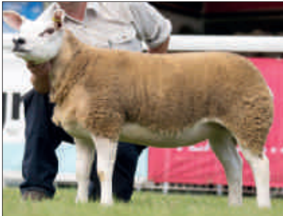
1st prize ewe lamb and Reserve Female Champion RWAS 2015