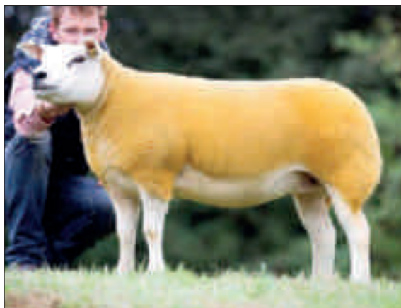
7000GN WELSH EWE

An outstanding opportunity to secure an embryo with first class breeding. The dam is also dam of 7000gn ewe sold at Worcester and her progeny have currently grossed the Welsh flock in excess of £18,000. The sire of the embryo is a very exciting purchase for the flock after observing the excellent offspring of of his full brother 85,000gn Cornmore Velvet Jacket in the Glenside flock.