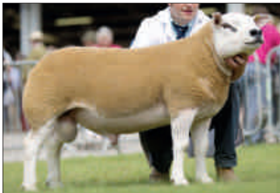
TOPHILL UNION JACK

Overall Champion Lanark 2013 and purchased for 11,000gns, Reserve Male Champion RHAS 2015. Union Jack has bred rams to 8000gn Vagabond, 4800gn Va Va Voom, 4000gn Ventura whose sons have sold to 32,000gns.