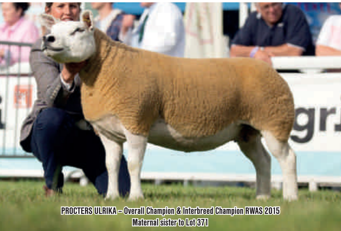
PROCTERS ULRICA – Overall Champion & Interbreed Champion RWAS 2015 Maternal sister to Lot 371