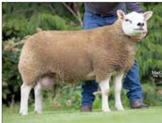
CRAILLOCH VA VA VOOM

Purchased Lanark 2014 out of a much admired Crailloch pen. Va Va Voom was purchased for his character, extreme length, size, top, tight skin and great carcase which we feel he has passed on to his progeny.