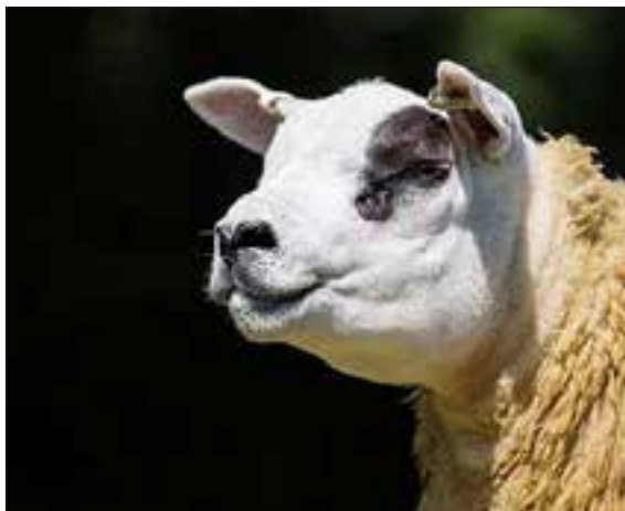
STRATHBOGIE YA PATCH

Purchased jointly with the Llangwm flock, a much admired lamb at Worcester. Purchased for his colours, length and terrific presence.