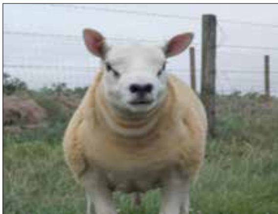
MILNBANK VAN WILDER

One of the best sons of 48,000gn Strathbogie Untouchable.