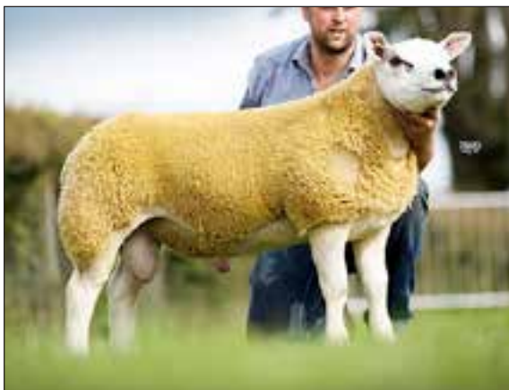
STRATHBOGIE YA BELTER

A joint purchase at 35,000gns at Lanark.