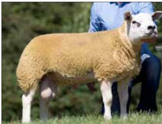
STRATHBOGIE YA PATCH

A much admired lamb when purchased jointly at Worcester this year, by the consistent breeder Windbrook and dam goes back to the great carcass Beauty ewe. A very powerful lamb with great skin and bursting with character.