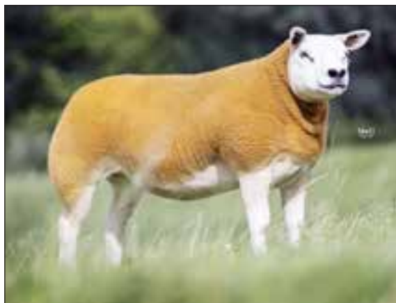
ET SISTER TO LOTS 431 AND 433

ET sister to Champion Female Lanark Scottish National Sale 2016 and sold for 6,500gns. Gdam is ET sister to Scholars Tiny Tempo 13,000gns 1st prize ewe lamb Royal Welsh Show