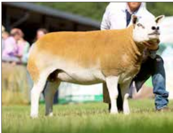
PLASUCHA TUTU - DAM OF LOT 428