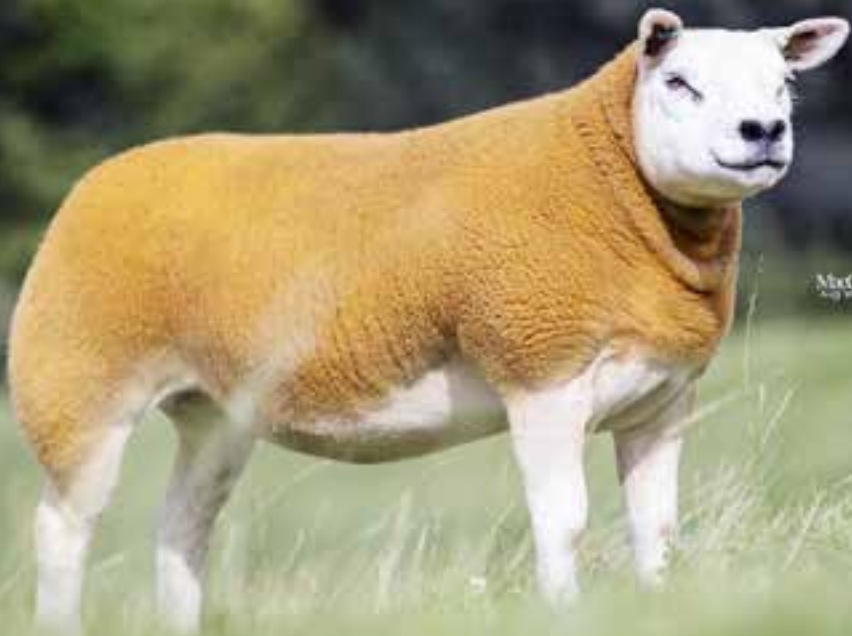
Plasucha Gimmer - ET sister to Lot 431 and Lot 433