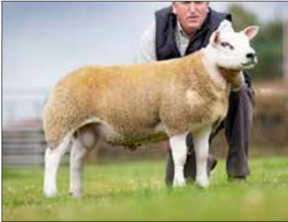
TOPHILL WALL ST

TOPHILL WALL ST HPH1500816(E) Born: 05/02/2015 Sire: PROCTERS VENTURA by TOPHILL UNION JACK HPH1300527(1) Dam: HPH1300531(E) by MILNBANK TIMES SQUARE LYM1200674(E) GDam: HPH1100193(E) by TAMNAMONEY ROB ROY SRY1000050(2) GGDam: HPH091165(E) by KNOCK ORION HAK08955(E)