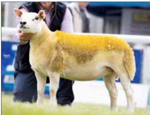
LOT 421 Welsh Your the Girl

Welsh Your the Girl has been a star from birth and has been admired by many breeders. Considered to be the best ewe lamb we have ever offered for sale. She is by Charben Warhorse an exciting ram which was retained by the Charben flock resulting in only a handful of lambs being on the ground out of this exciting line. We are very thankful that we had the use of this ram as he has given us some very well bred females. The dam of Your the Girl was purchased privately from the Cairness flock and is out of the 10,000gn Milnbank Tank.