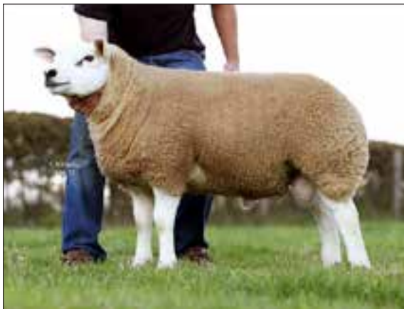
MATERNAL BROTHER TO LOT 430

One of the flashiest females offered for sale from the Plasucha Flock, sired by Garngour Upper Class 32,000gns. Dam is a top Garngour ewe who has bred rams to 8,000gns, 2,000gns, 1,700gns and 1,300gns.