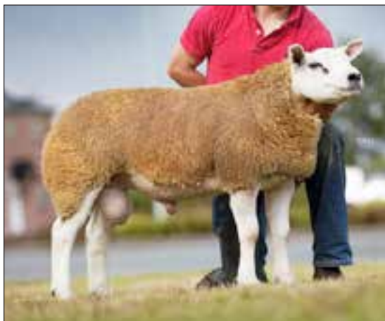
EDEN VALLEY WIZ KID

Champion Male and top priced ram lamb Welshpool National Sale 2015. Wiz Kid has bred rams selling to 6500gns twice in his first season, with many daughters being placed in the top 10 of the ewe lamb classes RWAS 2015.