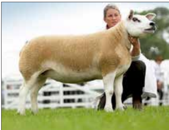
PFD15 00019 Reserve Overall Champion GYS 2016 sired by Tophill Union Jack

Overall Champion Lanark 2013 and purchased for 11,000gns, Reserve Male Champion RHAS 2015.