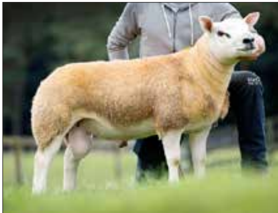
ARKLE YING YANG

Sired Arkle Ying Yang who sold for 32,000gns.