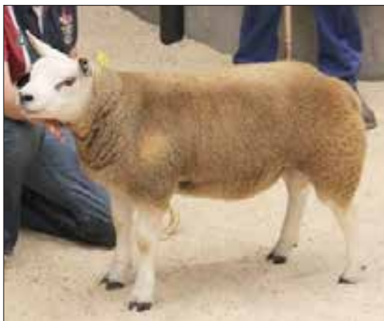
GARNGOUR UPPER CLASS

Purchased jointly for 32,000gns Lanark in 2013 and has pleased us very much since. He bred Male Champion RHASS 2015 and daughters have sold to 3,500gns also this year.