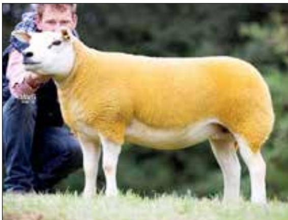
7000GN WELSH EWE

A retained son of Garngour Upper Class . From the same family at Scholars Tinie Tempo and the flocks Twilight topper gimmer from last year.