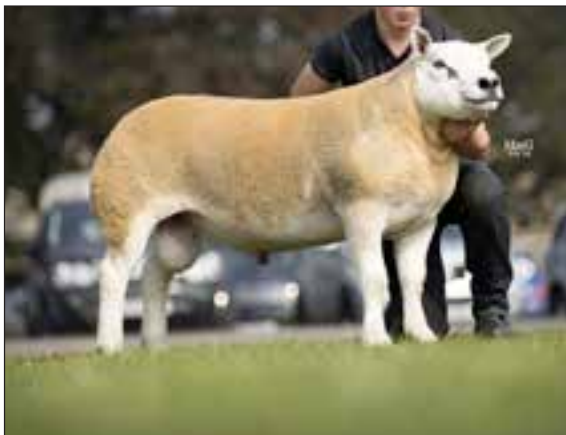
SCROGTONHEAD U STOATER

Record priced shearling at Kelso Ram Sale 2014, purchased for £35,000.