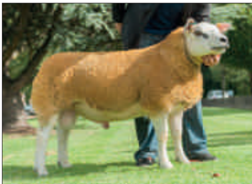
GLENSIDE WILD BOY

Purchased Carlisle for the second top price of 12,000gns. He is sired by the 38,000gns Glenside Vava Voom.