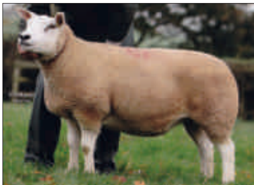
JKA09061 sold for 4000gns (2010) (daughter of 98/207)

Sire: MILNBANK SGT PEPPER LYM1100426(E) by GLENSIDE RAZZLE DAZZLE FPG100005 Dam: JKA09036(E) by GARNGOUR MAJOR CJN06018(2) GDam: JKA98207(2) by CRAIGHEAD DYNAMITE CMC97090(2) GGDam: JKA96012(2) by KERSE BUSTER DAK95006(1) Service Sire: PROCTERS VAGABOND by TOPHILL UNION JACK HPH1300527(1) Service Details: Served 19/10/2015 Dam of some of the gimmers in the sale, a great breeding ewe.