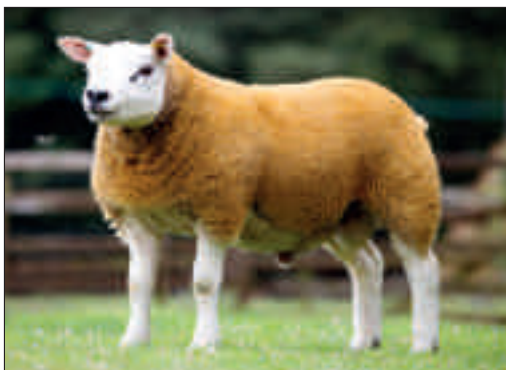
GLENSIDE WILLY NILLY

Purchased Lanark for 16,000gns. He is sired by the 85,000gns Cornmore Velvet Jacket.