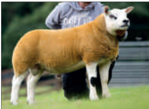
GLENSIDE WILLIE WINKIE

GGDam: FPG07969(2) by BAILEYS MEGA E.EBE06020(1)