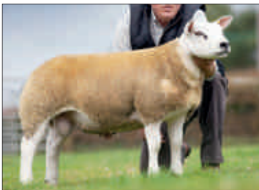
TOPHILL WALL ST

Purchased jointly for 32000gns Lanark 2015.