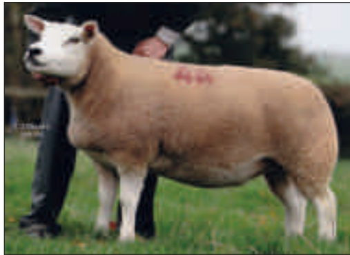
JKA09061 sold for 4000gns (2010) (daughter of 98/207)

Sire: KINGLEDORIS TALISMAN WRK1204484(E) by FOYLE VIEW SUPERSTAR SMV110055 Dam: JKA09024(E) by ETTRICK MCCOIST GGH06073(E) GDam: JKA03047(2) by CASTLECAIRN IRN BRU RNA02047(E) GGDam: GCW00076(2) by BALTIER FREDDIE FEB99011(1) Service Sire: PROCTERS VAGABOND by TOPHILL UNION JACK HPH1300527(1) Service Details: AI'd 23/09/2015 Scanned 2. Same family as Procters Annan 43.