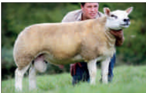
ELLEN VALLEY WARLORD

Massive son of the 11,000gns Vantastic. Warlord won 1st prize Worcester Sale and was purchased jointly for 10,000gns. Throughout the year breeders have talked about Texel's and their top lines - this ram has one of the best we have ever seen with head legs and a skin to match. Index 354